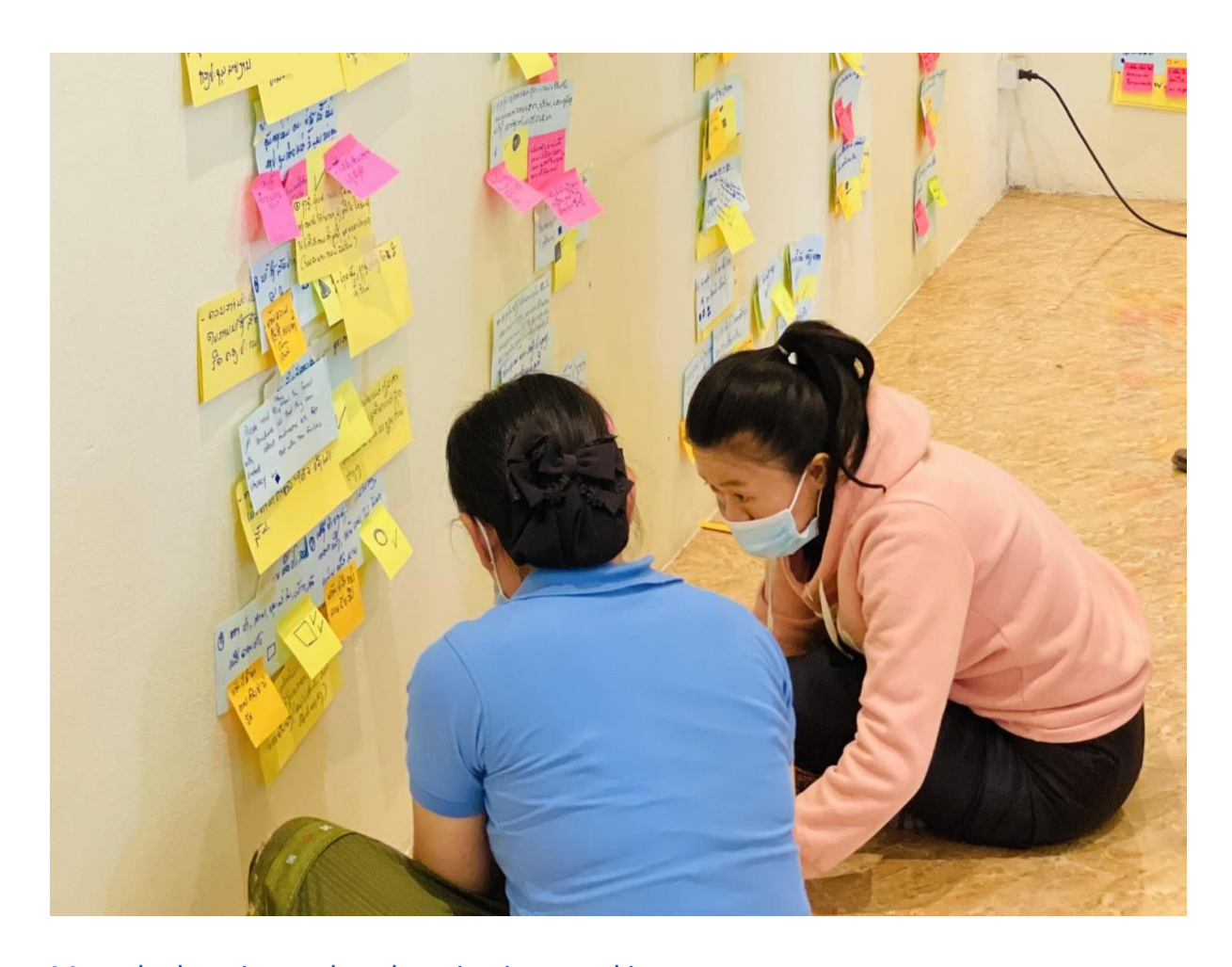
Mutual education and explanation in reworking arrangements

Perhaps one of the most powerful dimensions of the work involved several layers of explaining and building mutual understanding; of villagers explaining protected area staff, district staff explaining to protected areas, and protected area staff explaining needs and requirements to provincial and national authorities. This process is on-going given the broad ambition of the FPIC action plan. Villagers not only raised concerns in 2021 meetings, but also went through further stages of elaboration in subsequent exchanges explaining particular uses for subsistence or commercial uses, requests and claims for change. Final village consent involved in specifying customary uses, specific land tenure requirements and deep-running cultural connections. Moving from a "paper park" design approach towards rehabilitating customary forms of use and practices is a long-term process.