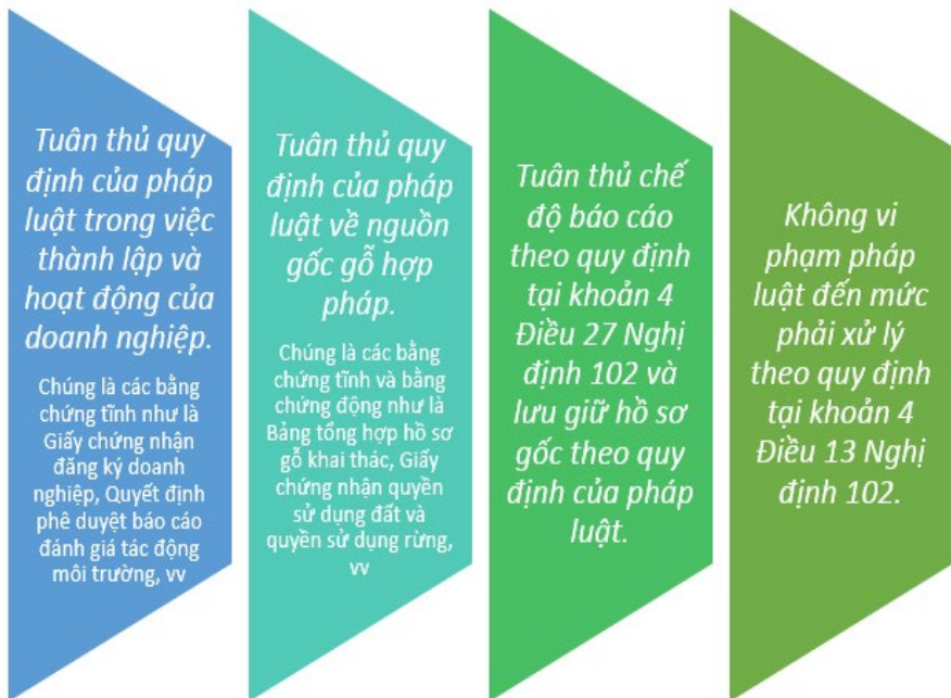
Figure 1: CLASSIFICATION CRITERIA OF TIMBER EXPORTING & PROCESSING ENTERPRISES

Classification criteria according to Article 12 of Decree no. 102 and documents proving compliance with the criteria for the classification of timber exporting and processing enterprises according to Appendix II issued together with Circular No. 21 are detailed at https://vbpl.vn/TW/Pages/vbpq-van-ban-goc.aspx?ItemID=143869 and https://vbpl.vn/bonongnghiep/Pages/vbpq-van-ban-goc.aspx?ItemID=152020