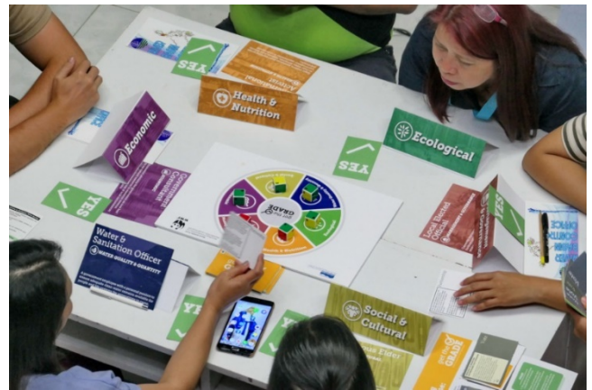
A role-playing game that allows river basin stakeholders to understand the multiple factors which influence a basin's overall health and appreciate collaboration during decision-making.

E2RB builds on the achievements and partnerships created during the implementation of previous and ongoing projects implemented by GIZ, USAID and Earth Security Partnerships in the Philippines as well as projects in neighbouring countries and GIZ global projects.