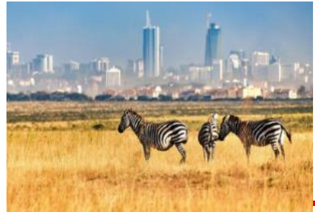
Nairobi National Park