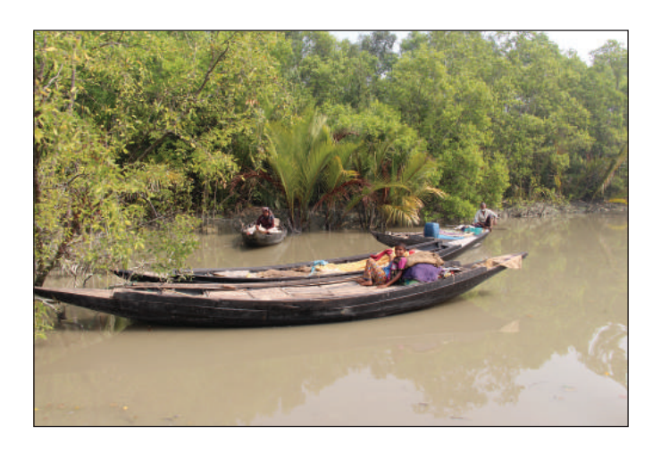
Area 3: Strengthening the capacity of the BFD for management and conservation of the Sundarbans

Sustainable management of the SMF is only possible by considering the needs and rights of the people depending on it. Therefore, resource users are empowered to better voice their concerns within the existing co-management structures and participate in decision making processes. Institutional and policy development helps to sustain these processes on the long term.