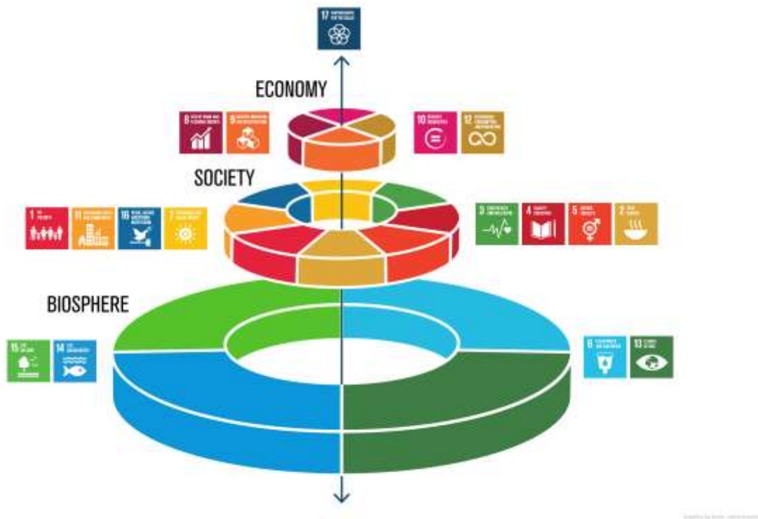
Figure 1: New way of viewing the SDGs presented by Johan Rockström and Pavan Sukhdev Illustration by J. Lokrantz/Azote. URL Website Oct 2016

SDG 13 – receives the highest contribution of both SN. Most projects work on target 13.2 (19 TUEWAS / 15 SNRD) Integrate climate change measures into national policies, strategies and planning and target 13.3 (17 TUEWAS/ 13 SNRD) Improve education, awareness-raising and human and institutional capacity on climate change mitigation, adaptation, impact reduction and early warning.