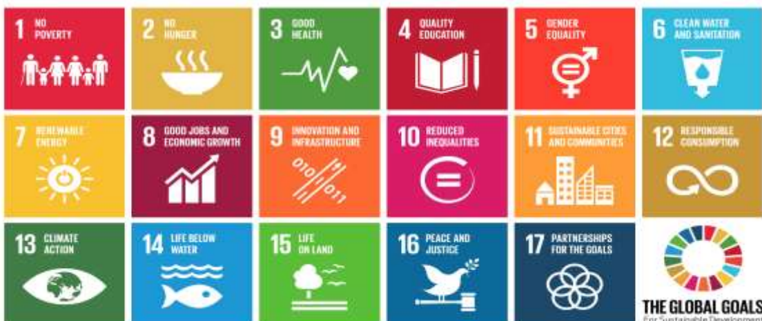
Figure 2 : SDG illustration by UNEP